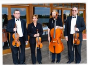
Mainly Mozart at a function at "The Boathouse" in Canberra