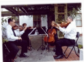
Mainly Mozart in the Senate Garden at Old Parliament House