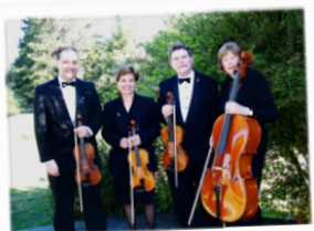
Mainly Mozart at a wedding in Hall, ACT

Mainly Mozart String Quartet features professional chamber music players who give an ambience to any gathering. Smartly dressed in black and white, their music gives every occasion a sense of style.